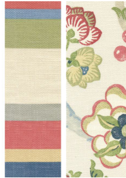
Fabrics that blend the feel of the beach with cottage style add a nautical twist