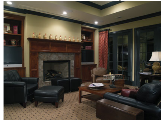
A space plan ensures that furnishings will fit and traffic will flow from one room to the next.