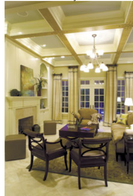
Windows and doors overlooking a view allow you to bring the outside in