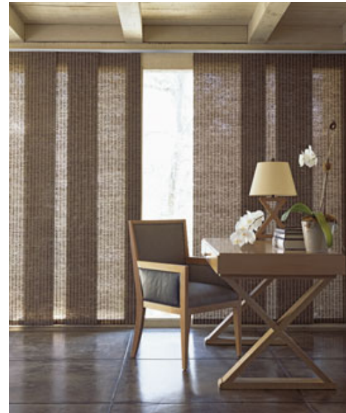
Natural materials like these woven PanelTrac® Shades from Kirsch® add interest to a space.